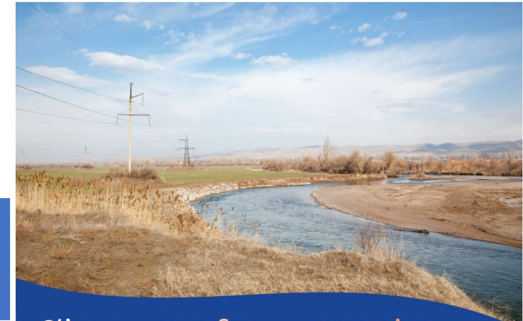
Climate-proofing cooperation in the Chu and Talas river basins