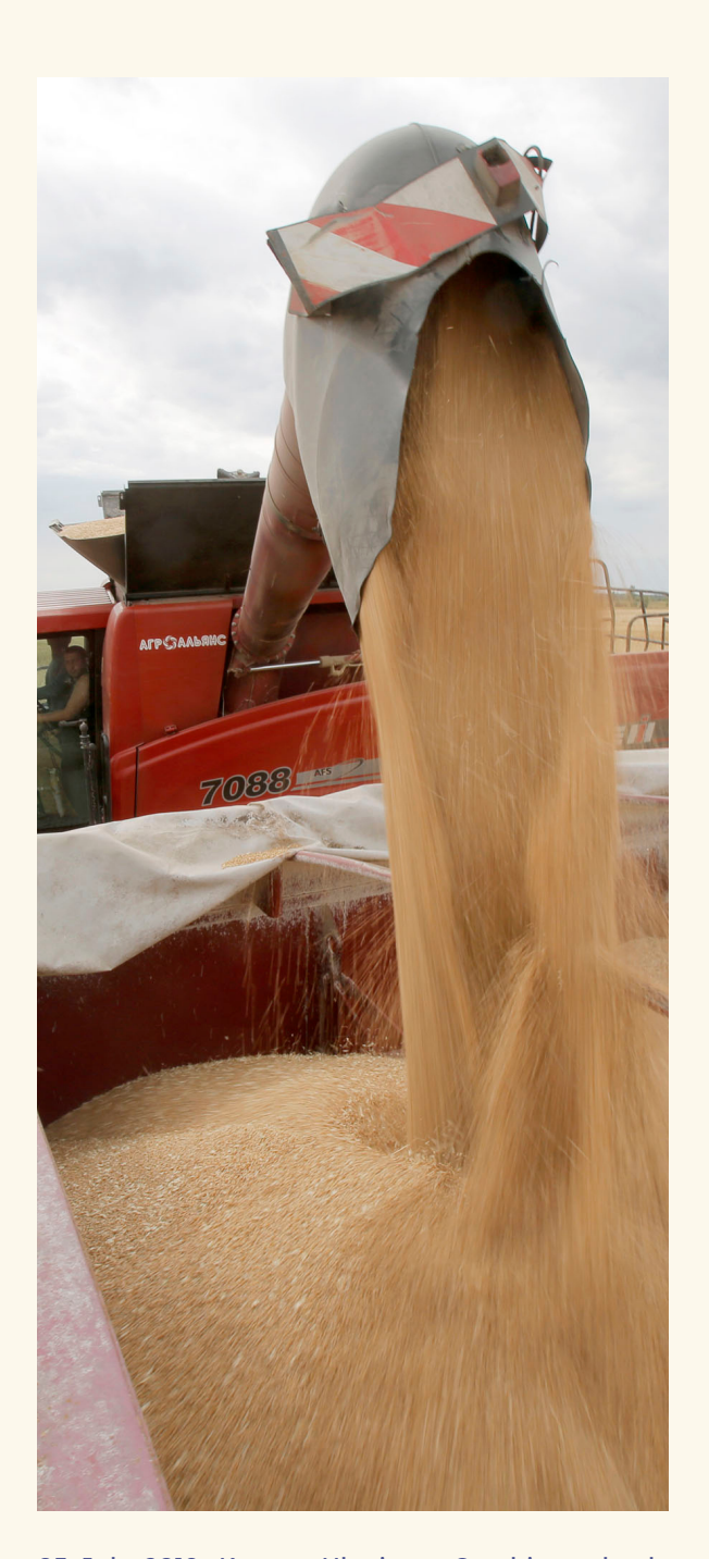
05 July 2019, Krasne, Ukraine - Combine reloads wheat into the bunker for further transportation during the harvest near the Krasne village.

This will be key to ensuring that views, challenges and solutions are considered from various stakeholders.